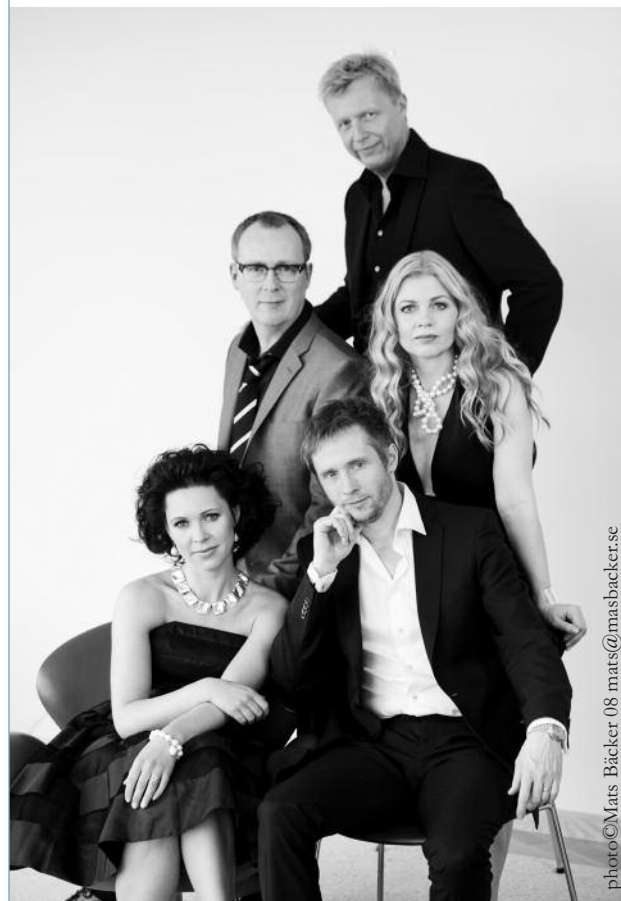
The Real Group